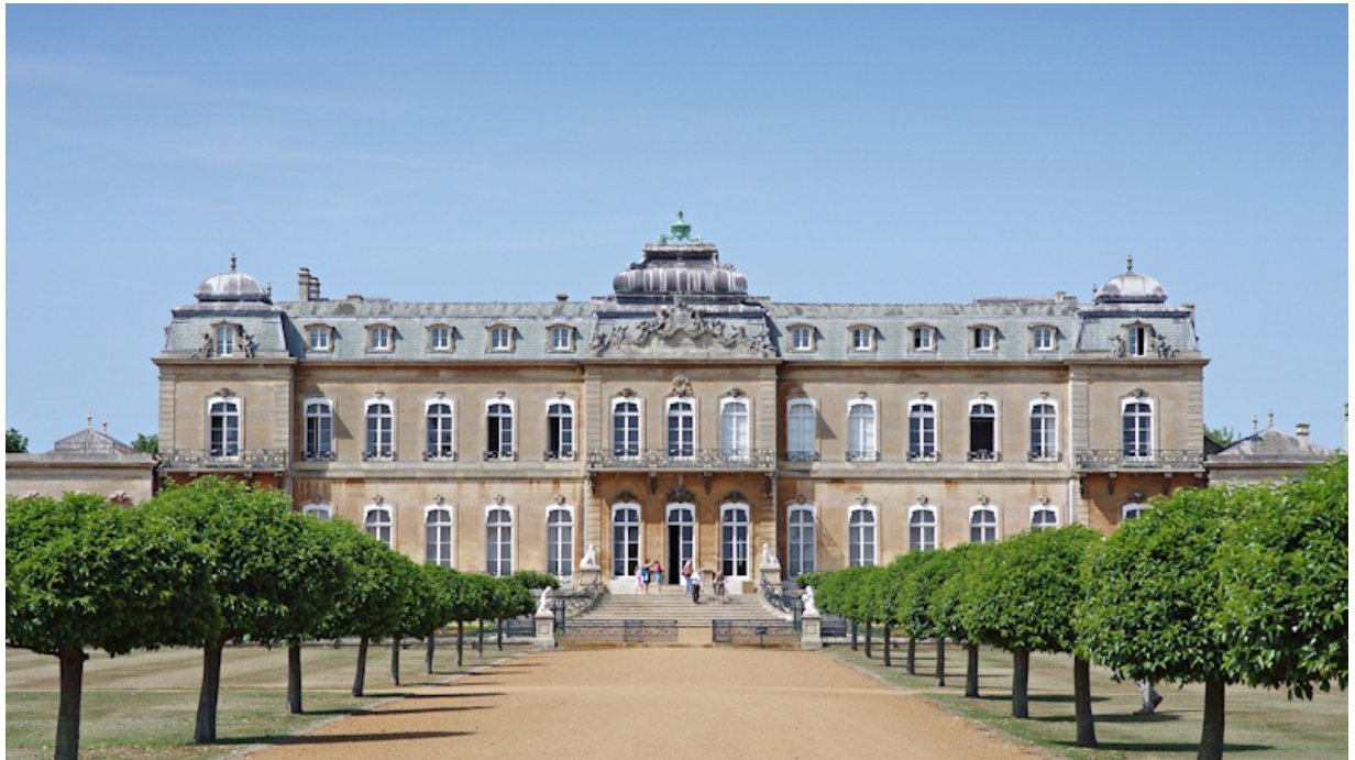
Wrest Park Country Estate