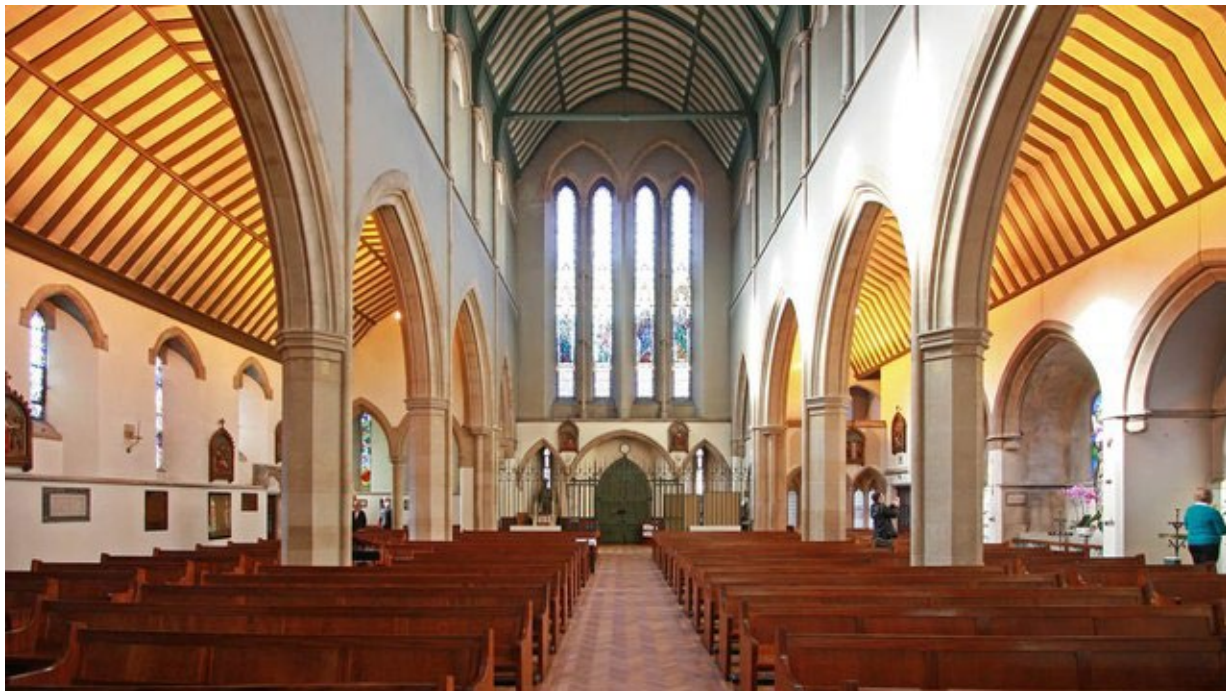
St Mary's Church